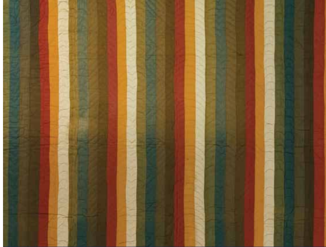
The upper portion of this quilt has faded, probably due to direct sunlight exposure. IQSC 2008.040.0029

All light fades and weakens textiles. Sunlight and fluorescent light are especially damaging because they emit high levels of ultraviolet radiation. Damage caused by light is cumulative and irreversible. Therefore, store textiles in darkness and dim the lights in areas where quilts and textile keepsakes are displayed. Keep the shades drawn on windows, reduce the number of lights and/or reduce the wattage of light bulbs, and turn off any artificial lights when not in a room.